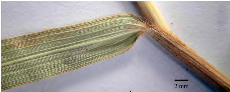
Fig. 3. Eulalia simonii . Abaxial leaf surface and leaf sheath ( Ridley BES 00767 , PERTH).